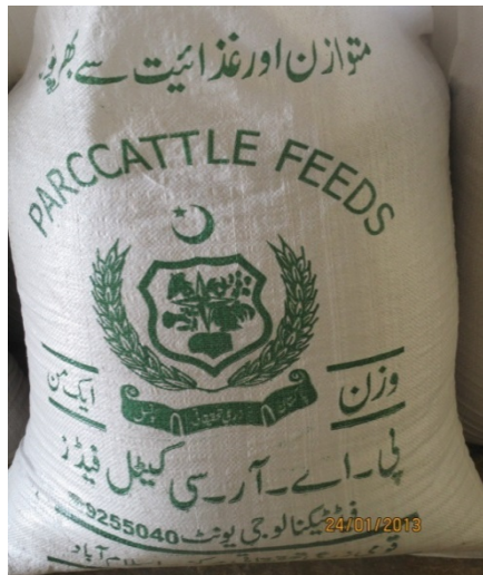
PARC Cattle Feed