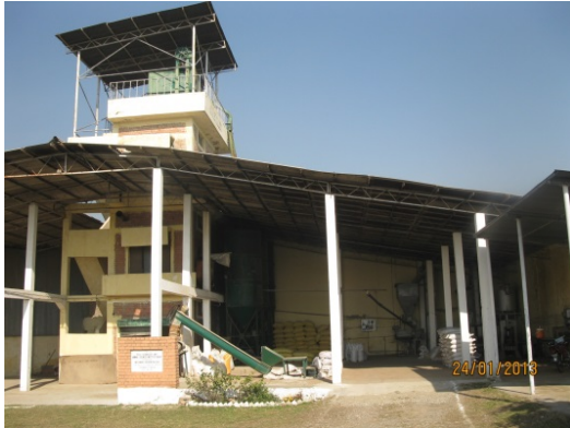
Feed Technology Unit at NARC (Established. 1986)